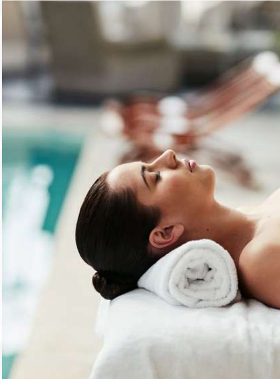
Wellness and Spa Facilities